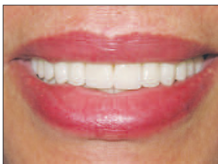
Close-up of new smile.