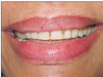
Close-up of pre-operative Smile.