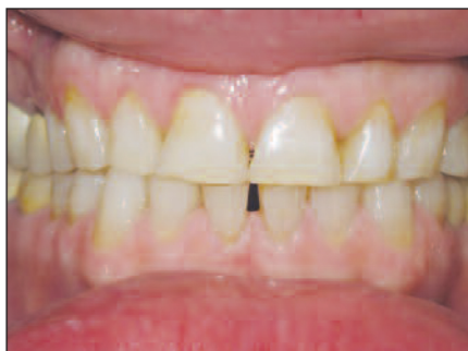
Retracted view of initial situation.