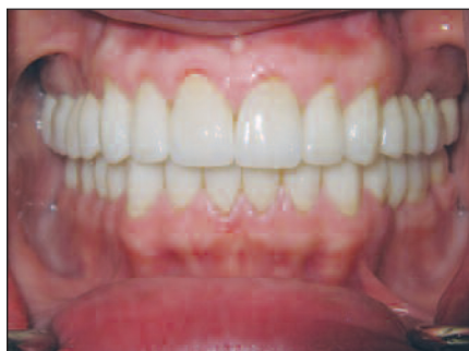
Retracted view of corrected smile.